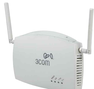
3Com AirProtect Sentry 5850 Wireless Intrusion Prevention System

The 3Com AirProtect Sentry 5850 Wireless Intrusion Prevention System can be set up in less than 15 minutes. A simple web interface guides you through the appropriate steps to quickly enable defense of your wireless network.