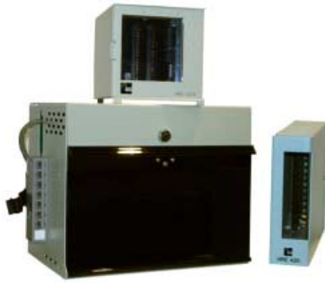
Enclosures and Shelves

9 / 0 4 • 1 2 9 4 5 7 4 Wireline Service Delivery Products