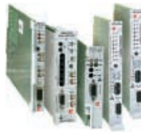
HiGain HDSL4 Remote Modules.