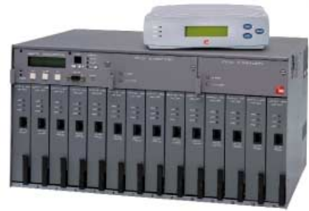
Campus-RS Rate-Selectable SDSL Systems

Featuring a flexible, rate-selectable design, the Campus-RS family of products seamlessly accommodates a wide range of network interfaces and access speeds. The result is an innovative system that delivers high performance and cost savings by supporting a wide range of applications through a single platform solution. Campus-RS can be used for local area network (LAN) extension, remote data access, PBX networking, video conferencing and distance learning.