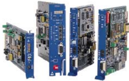
HiGain HDSL2 Modules