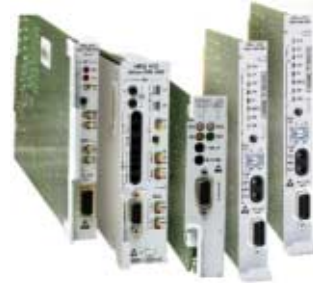
HiGain Remote Units

ADC's HiGain® HDSL2 modules enable networks to operate even more efficiently and at lower temperatures than current technology allows. Power consumption and heat dissipation is reduced by more than 30 percent, enabling service provider's to avoid or defer capital expenditure additions to existing plants. By providing full-rate T1 access using just a single copper pair, HDSL2 enables service providers to quickly and cost-effectively meet the demand for more voice and data services – services that have become increasingly hard to deliver due to the shortage of copper cable.