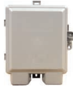
Low Profile Access Point

ADC's carrier class LoopStar™ 200 Wi-Fi solutions feature an industry-first, line-powered access point that offers service providers a low-cost and easy-to-deploy approach for building a network of Wi-Fi hotspots. The LoopStar Wi-Fi family provides solutions for access point only applications and more elaborate access point plus access controller functionality. Supporting ADSL access technology, the LoopStar Wi-Fi products provide line-powering capability that allows access points to be located where needed when commercial power is not readily available. With this Wi-Fi solution, service providers can fully leverage the value of their copper infrastructure and network assets to extend broadband wireline into the wireless network.