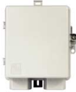
Outdoor Access Point