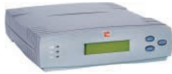
Campus-RS Remote Unit

Wireline Service Delivery Products 9 / 0 4 • 1 2 9 4 5 7 4