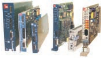
HiGain HDSL4 DS1 Service Modules.

Wireline Service Delivery Products 9 / 0 4 • 1 2 9 4 5 7 4