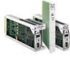
HiGain HDSL Repeater Modules.

ADC T1 transport products provide the most cost-efficient solutions for service providers to grow T1/E1 business services using HDSL, HDSL2, and/or HDSL4 technology. The Wideband System 3190 combines an industry-standard SONET or DS3 multiplexer with ADC's industry-standard HDSLx distribution system. In addition, the Wideband System 3190 offers full compatibility and interoperability with ADC's HiGain products for HDSLx transport of DS1 over copper.