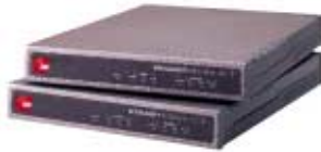
Megabit Modems 410F, 420F

9 / 0 4 • 1 2 9 4 5 7 4 Wireline Service Delivery Products