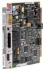
Soneplex HDSL2 Central Office and Remote Modules

Wireline Service Delivery Products 9 / 0 4 • 1 2 9 4 5 7 4