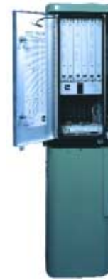
PG-Flex plus Broadband Micro-DLC

The PG-FlexPlus Edge RAM is a line powered and environmentally hardened ADSL remote access multiplexer. It is designed to enable telephone companies (telcos) to offer ADSL service to users that live beyond 12kft from either the central office (CO) or DLC remote. With its line powering and outside plant friendly enclosure options (indoor/outdoor, wall, pole and pedestal mountings), the Edge RAM gives telephone operating companies unprecedented flexibility and speed of deployment to provide ADSL service in hard to reach and low take-rate areas.