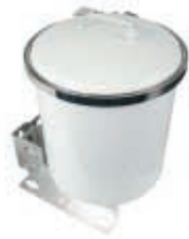
Radiator II – Above Ground

Wireline Service Delivery Products 9 / 0 4 • 1 2 9 4 5 7 4