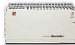
Soneplex Broadband System Chassis

LoopStar™ 400 is an intelligent, carrier-class broadband access and transport system that allows service providers to cost-effectively deploy and manage HiCap T1 services using their existing TDM networks and local loop facilities. The system features interchangeable multiplexer cards for easy expansion of network capacity demands and multiple T1 local loop transport cards for variable loop deployment options.