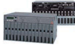
Campus-RS Star Platform Aggregates Multiple HDSL Connections.

The Campus-RS Star system provides a central site platform for aggregating multiple HDSL connections. It interoperates with any combination of Campus-RS remotes or other Campus-RS Star platforms to The Campus-RS Star system provides a central site platform for aggregating multiple HDSL connections. It interoperates with any combination of Campus-RS remotes or other Campus-RS Star platforms to provide support for a variety of voice, video and data applications such as LAN extension, video conferencing, and PBX extensions in a private enterprise network.