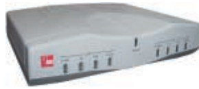
Megabit Modem 701G2