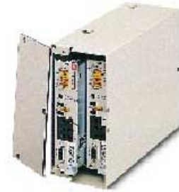
Soneplex HDSL Remote Enclosure

ADC's HDSL2 Central Office (LPS-H2C) and HDSL2 Remote (H2TU-R) modules are designed for the Soneplex system. Soneplex offers the highest quality, lowest cost T1 delivery solutions to business customers today. The H2LXC and H2LXR operate together to provide full-duplex DS1 transport over a single unconditioned, non-loaded copper pair up to 12,000 feet.