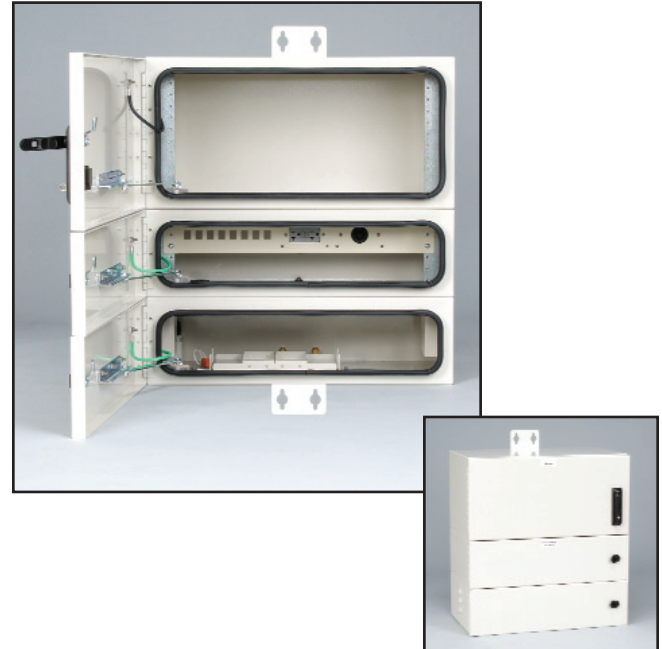
Multiple Compartment Configuration (RL3000B shown)

CUBE RM and RL Series Cabinets are designed for traditional 19" or 23" rackmount equipment. Flexible designs can be configured to support virtually all telecommunications, utility, CATV, or wireless applications. Chambered designs provide for restricted access to equipment only by authorized personnel. RL Series cabinets are certified to Telcordia GR-487 specifications for electronic equipment cabinets.