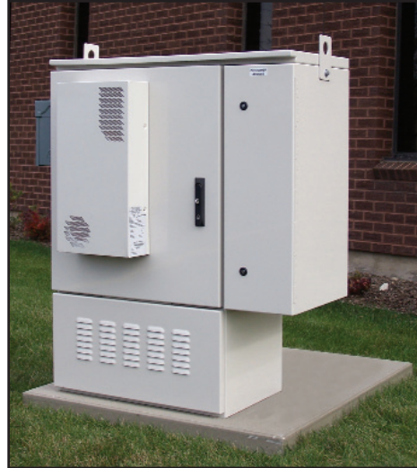
Pad Mount Configuration (PM4300 shown)

AC and DC powering options are available, with an isolated battery chamber available for AC configurations.