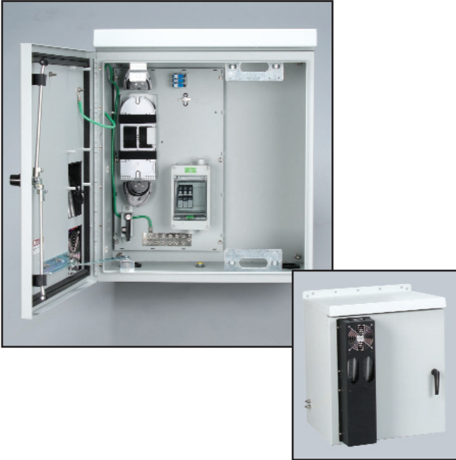
Backplane Mount Configuration (VM1100 shown)