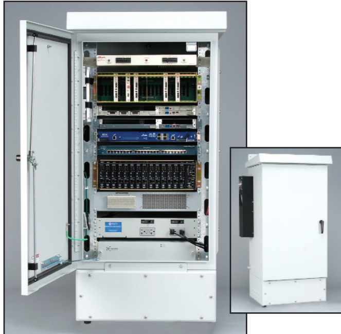
Single Compartment with BBU Configuration (RM2000B shown)