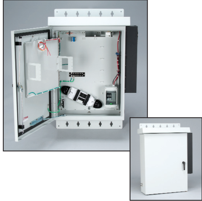
Swing Mount Door Configuration (VM1400 shown)

CUBE VM Series Cabinets are designed for mounting electronics, splice trays and other communications equipment directly to the backplane of the enclosure. Technicians have easy access to internal equipment and ample room for cable management. A swing out door option allows multiplexers and other rack equipment to be secured to the cabinet's door for even greater access to both front and rear connections.