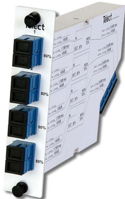
Quad 1x2 SC/UPC splitter Part #056-1419-6161