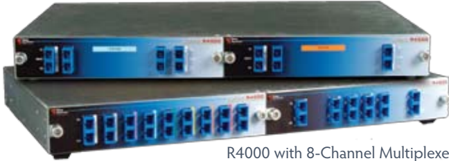
R4000 with 8-Channel Multiplexer Module and 4-Channel Multiplexer Module

The Metrobility R4000 Coarse Wave Division Multiplexing (CWDM) solution from Telco Systems® provides a cost-effective “no new fiber upgrade” solution for adding new services and customers to an existing fiber infrastructure.