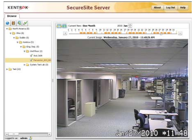
SecureSite allows real-time viewing of site activity

The Kentrox Remote monitoring and control device resides at the remote site. It identifies camera motion and sends an SNMP event or alert to the Kentrox Optima management or NOC-selectable system. Optima then provides the motion alarm to technicians or security personnel who can click through to the SecureSite server to view or download images. Personnel can also directly access cameras for live viewing, such as for helping to remotely troubleshoot issues when personnel are onsite.