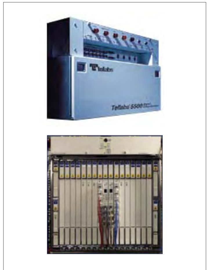
Tellabs® 5500 Digital Cross-Connect System and Port Shelf

Two new VQE mapper modules provide both VQE and traditional cross-connect functionality. The MM24V (VQE mapper module) delivers up to 128 ms endpath delay processing and the MM24VE (VQE extended mapper module) delivers up to 255 ms endpath delay processing, one of the best in the industry. Both the MM24V and MM24VE support the current functionality of the existing Tellabs 5500 system mapper modules in addition to providing Tellabs VQE. The MM24V/VE fits into the existing mapper module slots of the Tellabs 5500 system High Density 96 (HD-96) shelf. Each MM24V has a capacity of 4032 voice channels (6 STS) of Tellabs iVQE, for a total of 16,128 voice channels (24 STS) per HD-96 shelf. The MM24VE module has a capacity of 2016 voice channels (3 STS) of Tellabs iVQE, for a total of 8,064 voice channels (12 STS) per shelf. Remaining HD-96 shelf capacity can be used for traditional digital cross-connects, thereby optimizing the utilization of the HD-96 capacity. The MM24V/VE provides any-to-any interface flexibility as all current and future interfaces on the Tellabs 5500 system can be routed to the MM24V/VE for VQE processing. Tellabs 5500 iVQE allows carriers to provide consistent voice quality across all switch vendor types and feature package loads without using switch resources or separate VQE equipment.