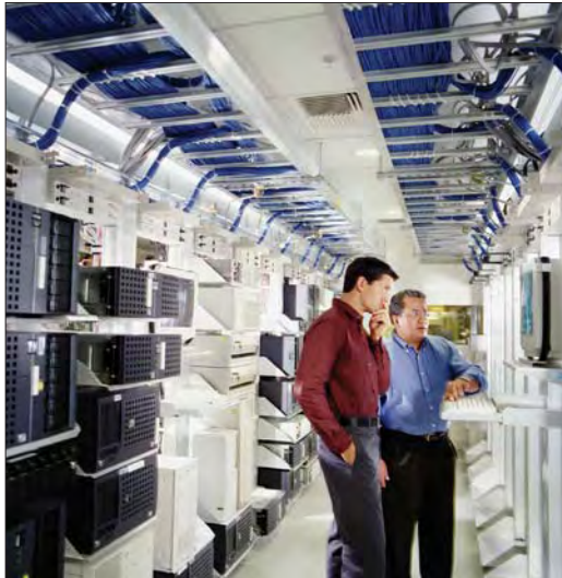
The Tellabs 5500 NGX-S switch simplifies service delivery and helps reduce operating costs.

SONET transport, wideband and broadband traffic provisioning are consolidated in a single network element, with powerful traffic testing, and performance monitoring capabilities down to the single DS-1 circuit level, vastly simplifying and automating circuit turn-up, testing and delivery. The Tellabs 5500 NGX-S switch also performs Level 2 performance and alarm monitoring to simplify operational practices for higher speed interfaces. Manual labor associated with legacy equipment is reduced via point-and-click provisioning through the Tellabs® MetroWatch™ NGX Element Manager. The Tellabs 5500 NGX-S switch is also compatible with existing OSS management systems including Telcordia OSMINE elements.