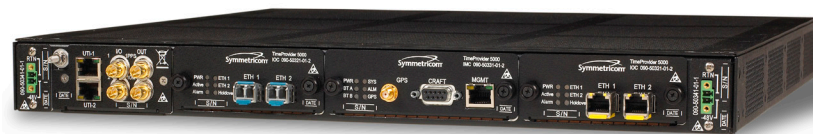
TimeProvider 5000 IEEE 1588-2008 Grandmaster Clock